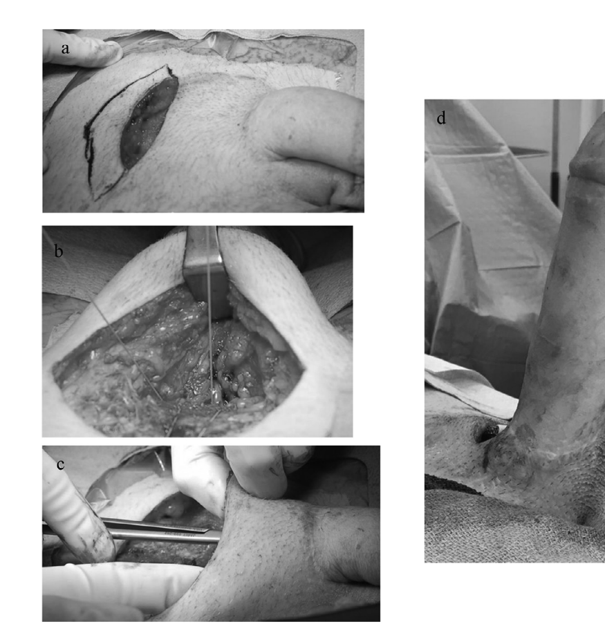
Figure 1. Stepwise technique of inflatable penile prosthesis insertion: (A) suprapubic incision, (B) penile dissection, (C) anchoring of periosteal Fiberwire suture, (D) final inflation. Color version of figure is available online.

All patients have a urine culture before surgery, and any patient with a true urinary tract infection (symptomatic, pyuria, high concentrations of bacteria) are treated before implant with culture-specific oral antimicrobials for at least 72 hours before surgery and